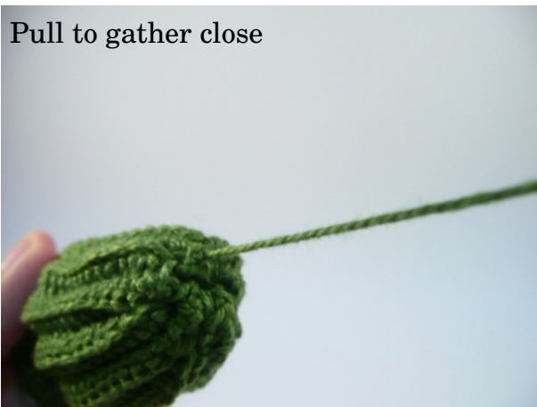
Pull to gather close